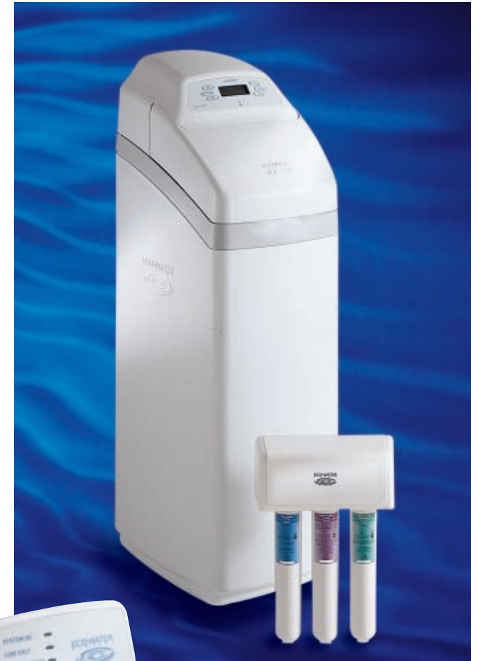
Series 3000 Remote Monitor

Enjoy cleaner, clearer water throughout your home.